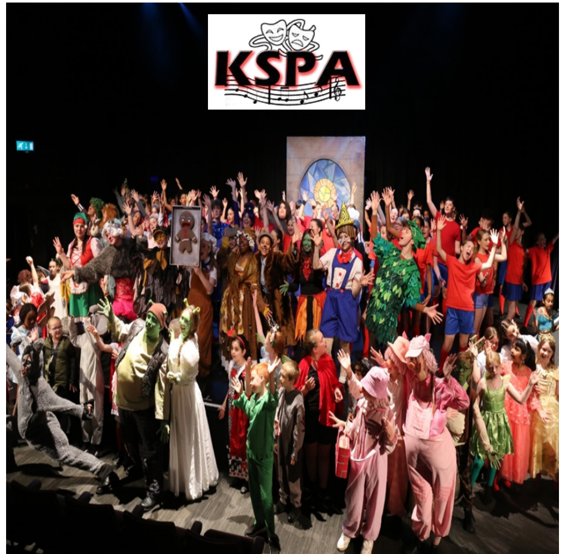
The Canterbury Institute for The Performing Arts

Many students have gone on to appear on stage, in film and on TV. Others have gone on to top class universities, for example; Royal Academy for Dramatic Arts (RADA), Italia Conti, Emil Dale, Performers College, Bird College and Urdang.